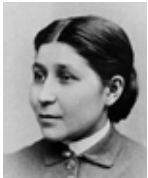
Dr. Susan La Flesche Picotte

Head of Methodist Hospital and founding member of the NHA, serving as its first Vice President.